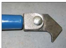
Gatekeeper Hook for cleaning out the saw cut

If you have chosen to dry cut, clean the saw cut and surrounding area using the specified power sweeper. Any excess residues should be cleaned out using the Gatekeeper Hook, or if a Hook is not available, you may use a straight edge screwdriver.